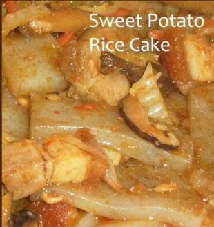
Sweet Potato Rice Cake