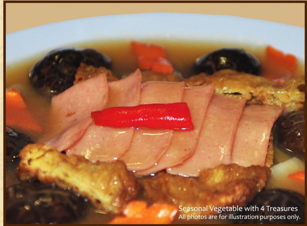
Seasonal Vegetable with 4 Treasures All photos are for illustration purposes only.