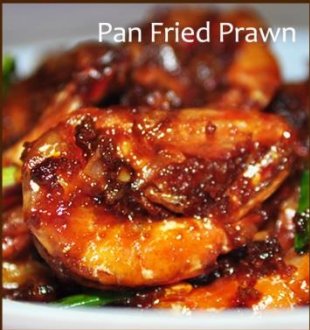
Pan Fried Prawn